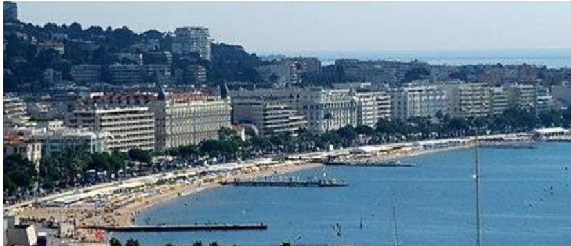
Cannes: Hotels along La Croisette and the beach The

<u>Day 3 – Thursday, October 12</u>: After breakfast, exploration of Grasse, with a guided tour of one of the numerous local perfume manufacturers. On to Cannes for a sightseeing tour, by little tourist train, of the old town and the waterfront boulevard, La Croisette, backdrop of the city's annual movie festival. After lunch we head for nearby Antibes, founded by the ancient Greeks, where we view the monument commemorating Napoleon's return from exile on the island of Elba and visit the local museum focused on the work of Picasso, who lived for many years in this area; the Picasso Museum occupies the site of the Greek acropolis, which became a Roman and then a medieval fortress belonging to the Grimaldis, a famous Genoese family whose descendants still rule Monaco. Return to our hotel in late afternoon and free evening.