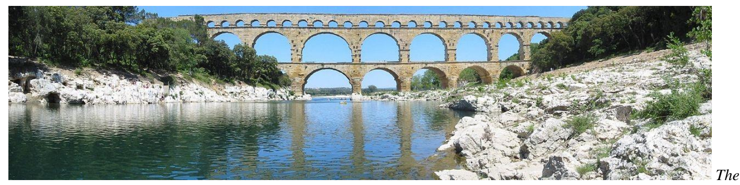
amazing Pont du Gard

the beautiful city of Nimes, where a tour by little tourist train will enable us to admire some very well-preserved Roman monuments, including a temple known as the Maison Carrée, as well as an amphitheatre (or arena) where bullfights are now occasionally performed. Continue to Arles, located on the banks of the Rhone River, an ancient and charming Provençal town featured in many paintings by Van Gogh, who lived here for some time. Our local walking tour there will include all the monuments that earned this town the title of UNESCO World Heritage Site: the Roman amphitheatre; the fine Romanesque Saint-Trophime Church; and the quaint Place du Forum, where the café featured in Van Gogh's 'Café Terrace at Night' is just perfect for a coffee break! On the way back to our hotel, we visit Le Mas des Tourelles, a winery where we will learn how wine was made by the Romans and taste wine still made the same way! No group dinner today.