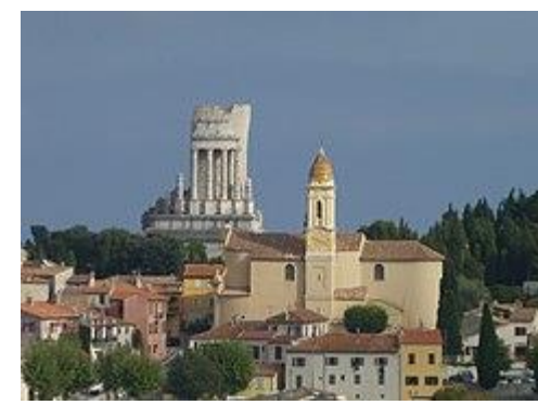
The Trophy of the Alps at La Turbie

<u>Day 4 – Friday, October 13</u>: Full-day excursion along the French Riviera, a.k.a. the Côte d'Azur. The most beautiful and interesting stretch, between Nice, the "queen city" of this playground, to the Italian border, involves three spectacular scenic routes known as Corniches. We start out along the Lower Corniche, a stunning drive along the coast all the way to Menton, the last town before the border. En route we will pay a visit to the Principality of Monaco, with the old town and the Prince's Palace as well as the Monte Carlo district with its famous Casino. Return via a stretch of the Grande Corniche, the high mountain road. In the village of La Turbie, an impressive monument, known as the "Trophy of the Alps," was erected by the Romans to celebrate their conquest of this southern part of Gaul, as France was known then, turning it into a province of their empire, hence the name Provence. It was here that a major Roman road entered Gaul, an extension of the famous Via Aurelia, but known locally as the Via Julia Augusta. Descending to the level of the Middle Corniche, we enjoy spectacular views of the Mediterranean coast as we head for Nice for a panoramic tour of this magnificent city, including its old town as well as the world-famous waterfront boulevard, the Promenade des Anglais. Return to our hotel in the early evening. Today, group <u>lunch or dinner</u>.